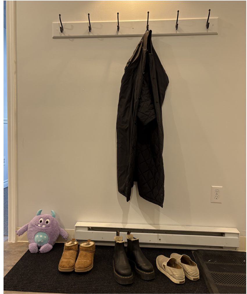
Jacket and shoes off.